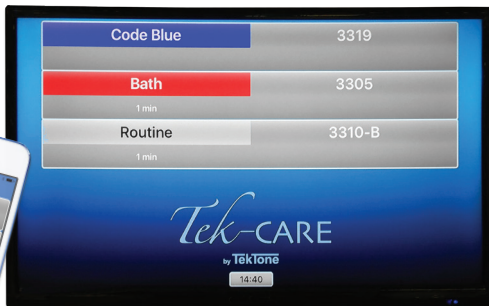
Tek-CARE® Staff App for iPhone, iPad, iPod touch and Android devices, and Tek-CARE App for Apple TV®