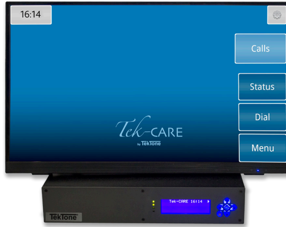
Tek-CARE Appliance Server (NC475DESK pictured)