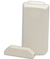
universal contact transmitters